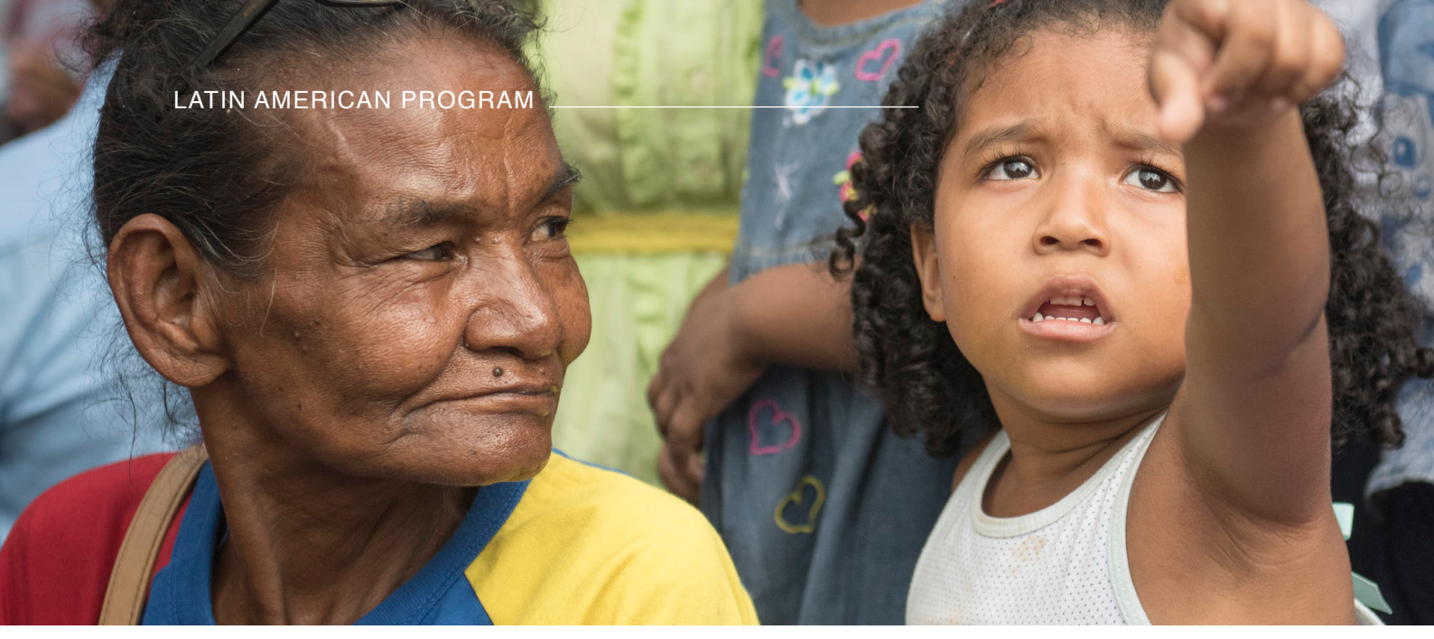
A Venezuelan grandmother and her granddaughter in Caracas, Venezuela.

The U.S. government has been the most involved in Venezuela, withholding diplomatic recognition from the de facto government, lobbying other countries to support economic sanctions to change Venezuelan policies or oust Maduro, and dissuading other countries from recognizing Maduro as the president of Venezuela. These efforts did not succeed over time.