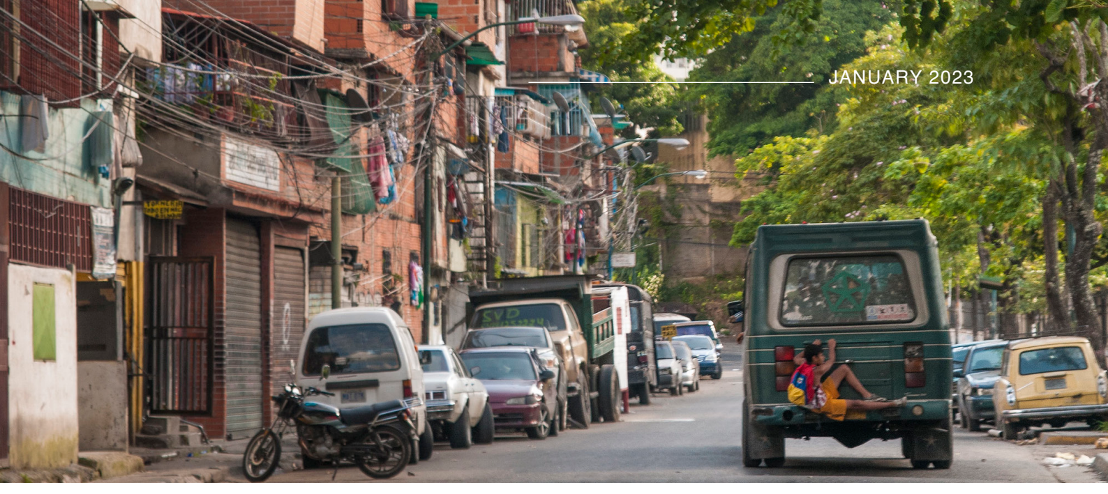
A Venezuelan child rides on the back of a vehicle in a neighborhood in Caracas, Venezuela.

ing extended to other international energy companies, including two European firms, ENI and Repsol, which have already been authorized to make some oil shipments to cancel Venezuelan debt. The U.S. government has signaled that additional licenses to facilitate investments in the Venezuelan oil industry are possible should negotiations advance. Some critics have argued that these agreements buttress the Maduro administration's credibility and financial resource base. Although these views are understandable, it should also be acknowledged that a changing global energy environment has already opened markets for Venezuela, even with significant U.S. sanctions in place. Those opportunities are likely to increase, not decrease, in coming months. Furthermore, as the Biden administration has made clear, U.S. concessions are designed to incentivize negotiations.