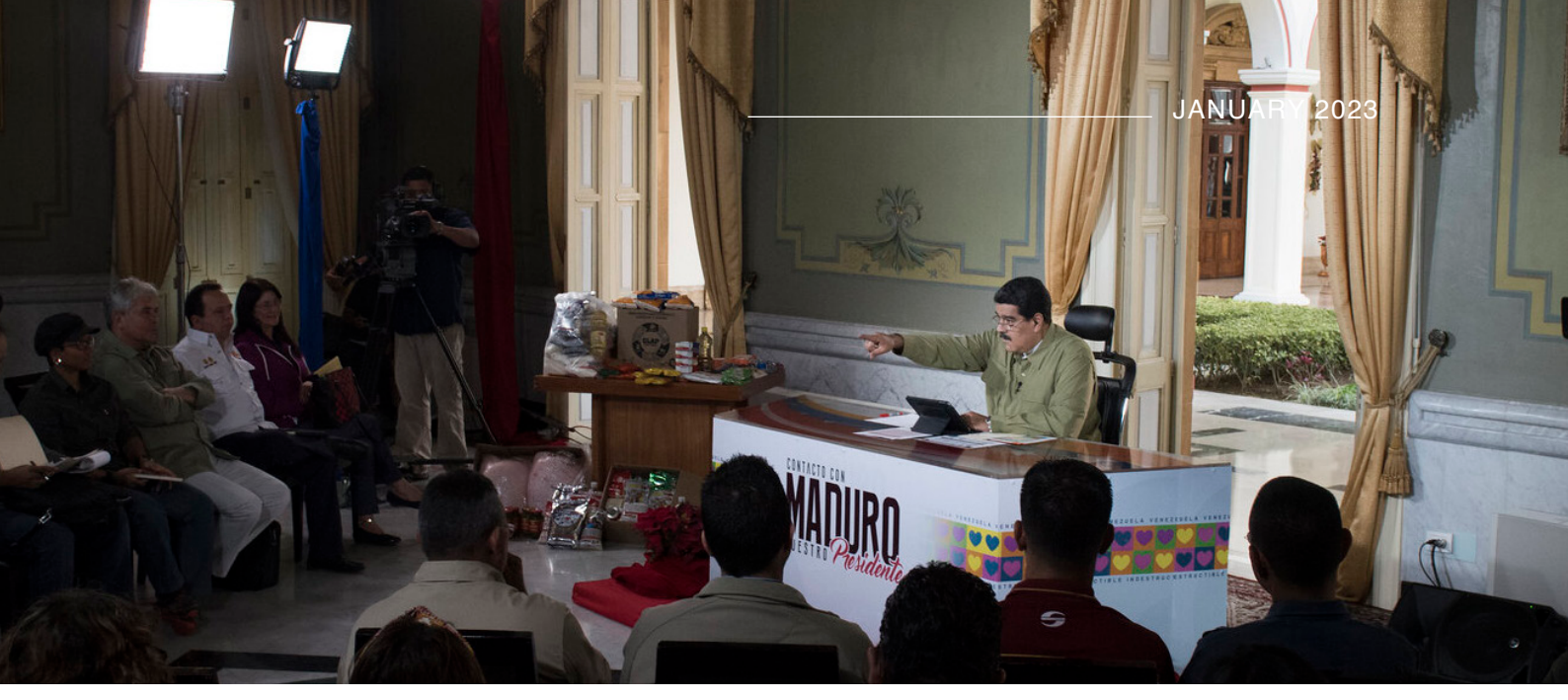
Venezuelan President Nicolás Maduro broadcasts of his weekly television program "Contacto con Maduro" from the Miraflores Palace. Source: Eneas De Troya, Flickr, December 18, 2016.

more decisive support from the U.S. government. For its part, Maduro's government repeatedly backed away from negotiations and used political dialogues for tactical advantage, to weaken the opposition and strengthen its own control. Each side now needs to step up firmly to the requirements of conflict resolution and forge workable compromises.