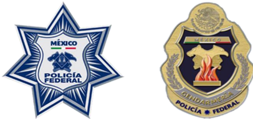
Figure 2- the Gendarmerie’s emblem took on the Federal Police (and previously AFI) Jaguar/Eagle Warrior crest but included a burning flame that symbolizes “transformative fire”

Nevertheless, the Gendarmerie was created on 22 August 2014 with an approved force strength of 5,000. It was to be a part of the CNS, mainly as the seventh division of the PF, joining 1) Intelligence, 2) Regional Security (Highways), 3) Counter narcotics, 4) Investigations, 5) Federal Forces and 6) Scientific divisions. 11 Intergovernmental and political compromises led to the redesign of the Gendarmerie from a mainly military organization specialized in counter organized crime activities to a civilian-led organization with a relatively diverse and somewhat unorthodox set of roles and missions. As the new Gendarmerie was looking to ‘find its place’ among the Mexican security community, it took on innovative, yet isolated roles such as the protection of ‘economic cycles’ via its rural security group, providing physical security for citrus producers in northern Mexico, border security, tourist safety, environmental protection, and community policing – the last three of which are not traditional for an intermediate force.