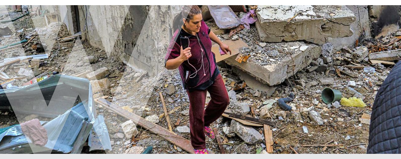
A woman walks through a housing complex destroyed in recent battles, in Nagorno Karabakh, Oct. 10, 2020.